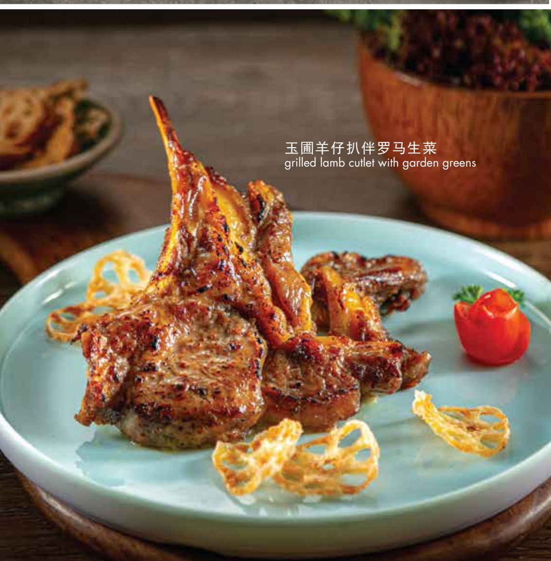
玉圃羊仔扒伴罗马生菜 grilled lamb cutlet with garden greens