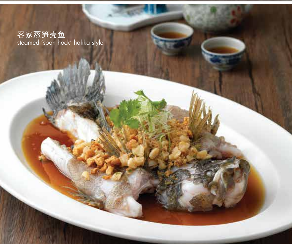
客家蒸笋壳鱼 steamed 'soon hock' hakka style