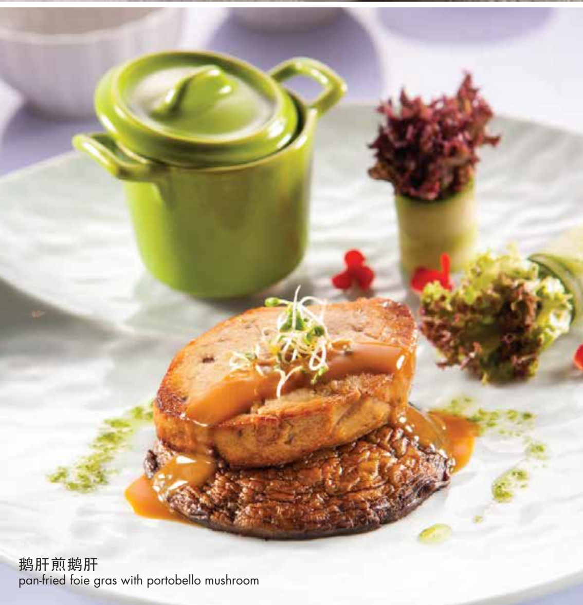
鵝肝煎鵝肝 pan-fried foie gras with portobello mushroom