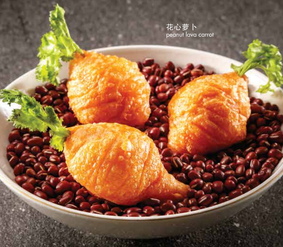
花心萝卜 peanut lava carrot