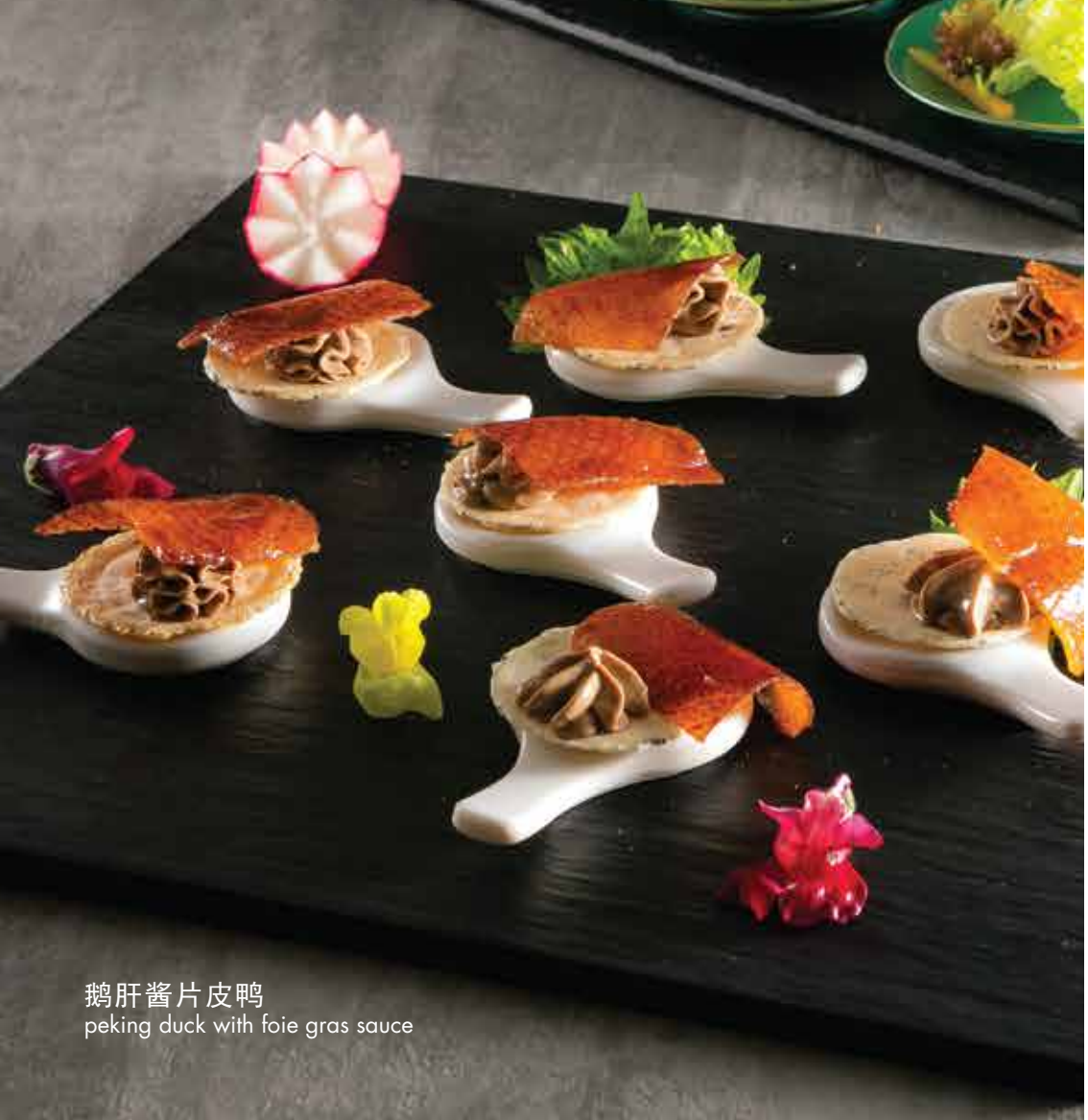
鹅肝酱片皮鸭 peking duck with foie gras sauce