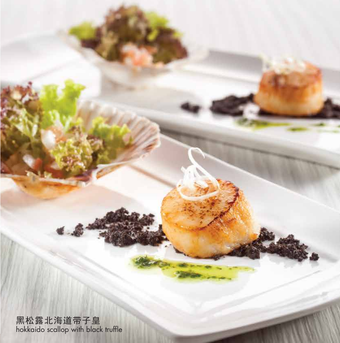
黑松露北海道帶子皇 hokkaido scallop with black truffle