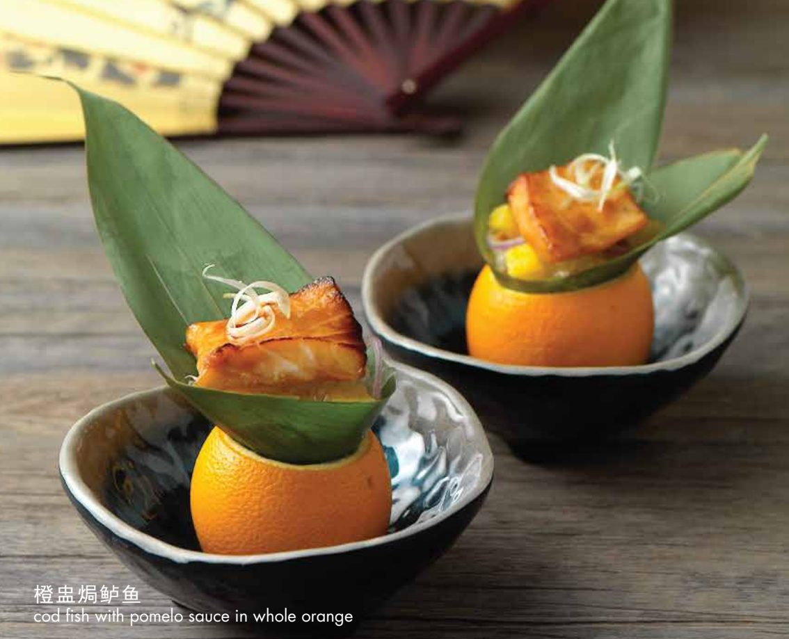
橙盅焗鲈鱼 cod fish with pomelo sauce in whole orange