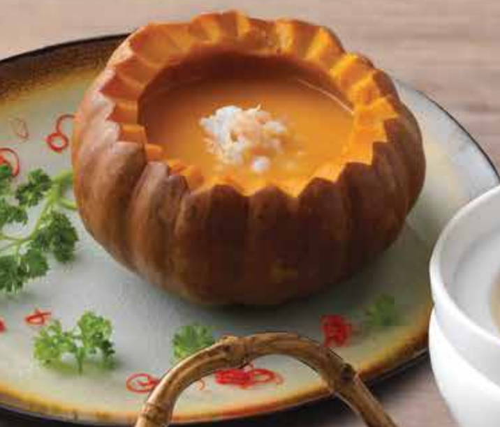
南瓜盅龙虾羹 lobster bisque in pumpkin