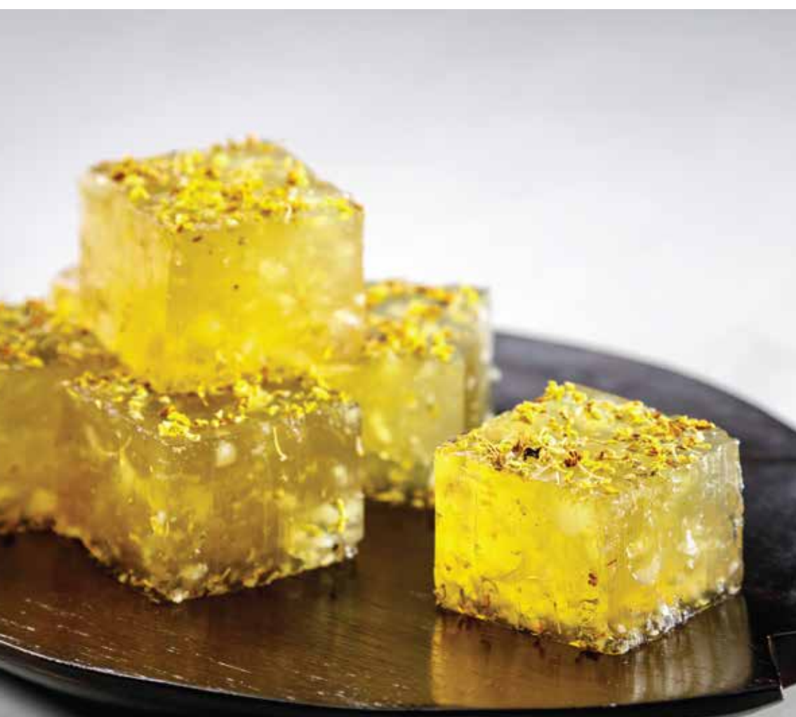
杭式马蹄桂花糕 water chestnut osmanthus jelly