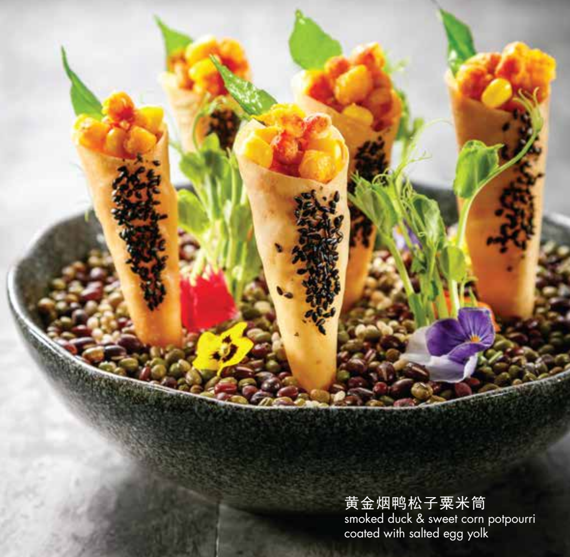
黄金烟鸭松子粟米筒 smoked duck & sweet corn potpourri coated with salted egg yolk