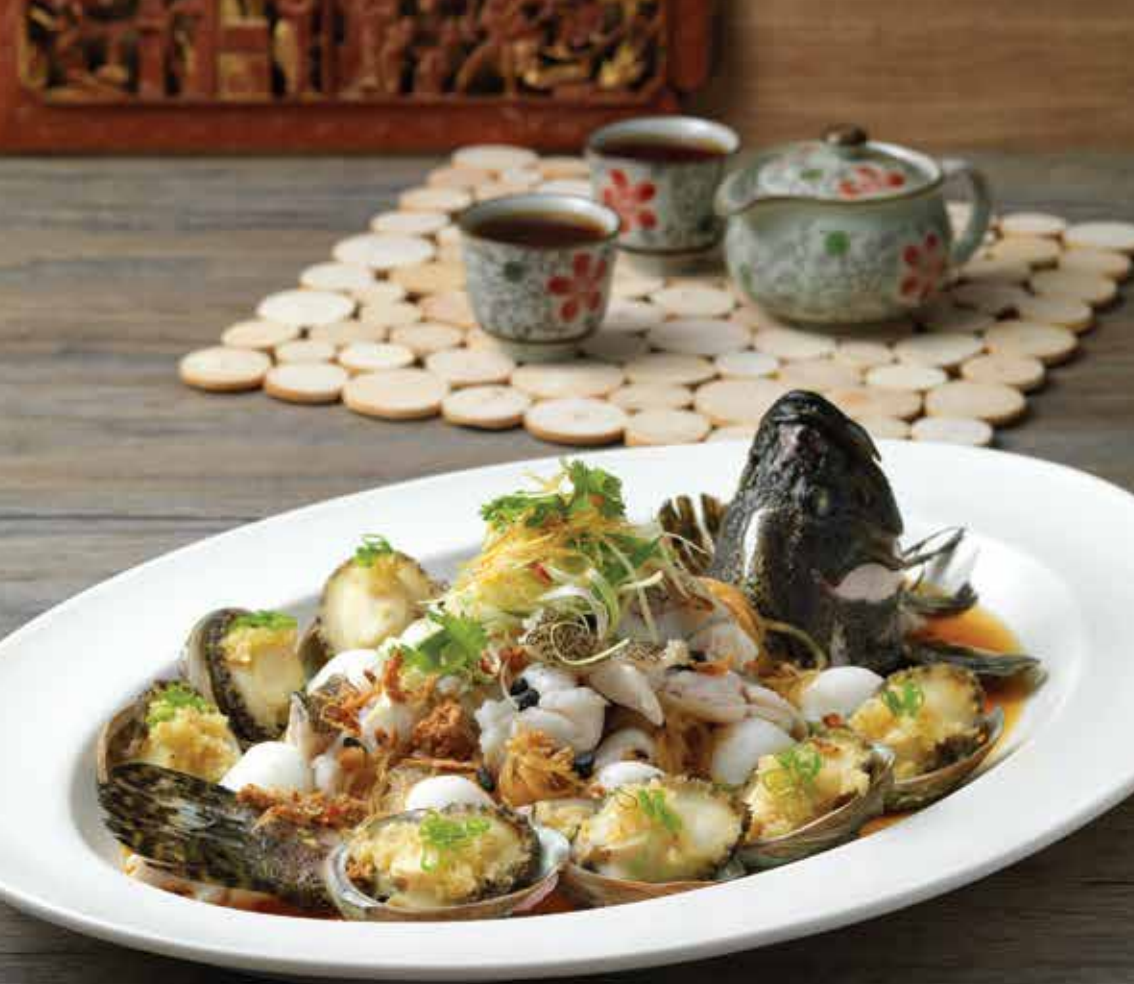
台山鲜鲍鱼蒸深海杉斑 steamed ocean garoupa with fresh abalone, luffa melon & squid ball taishan style