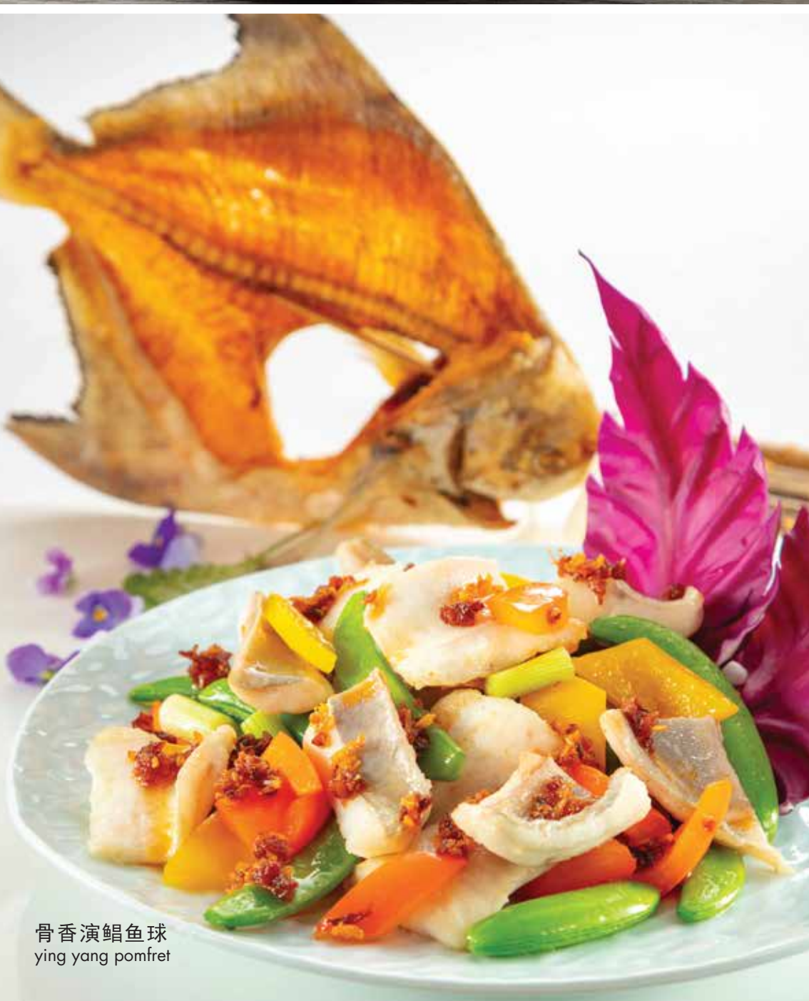
骨香演鲳鱼球 ying yang pomfret