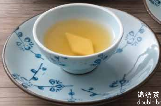
锦绣茶壶汤 double-boiled imperial teapot soup