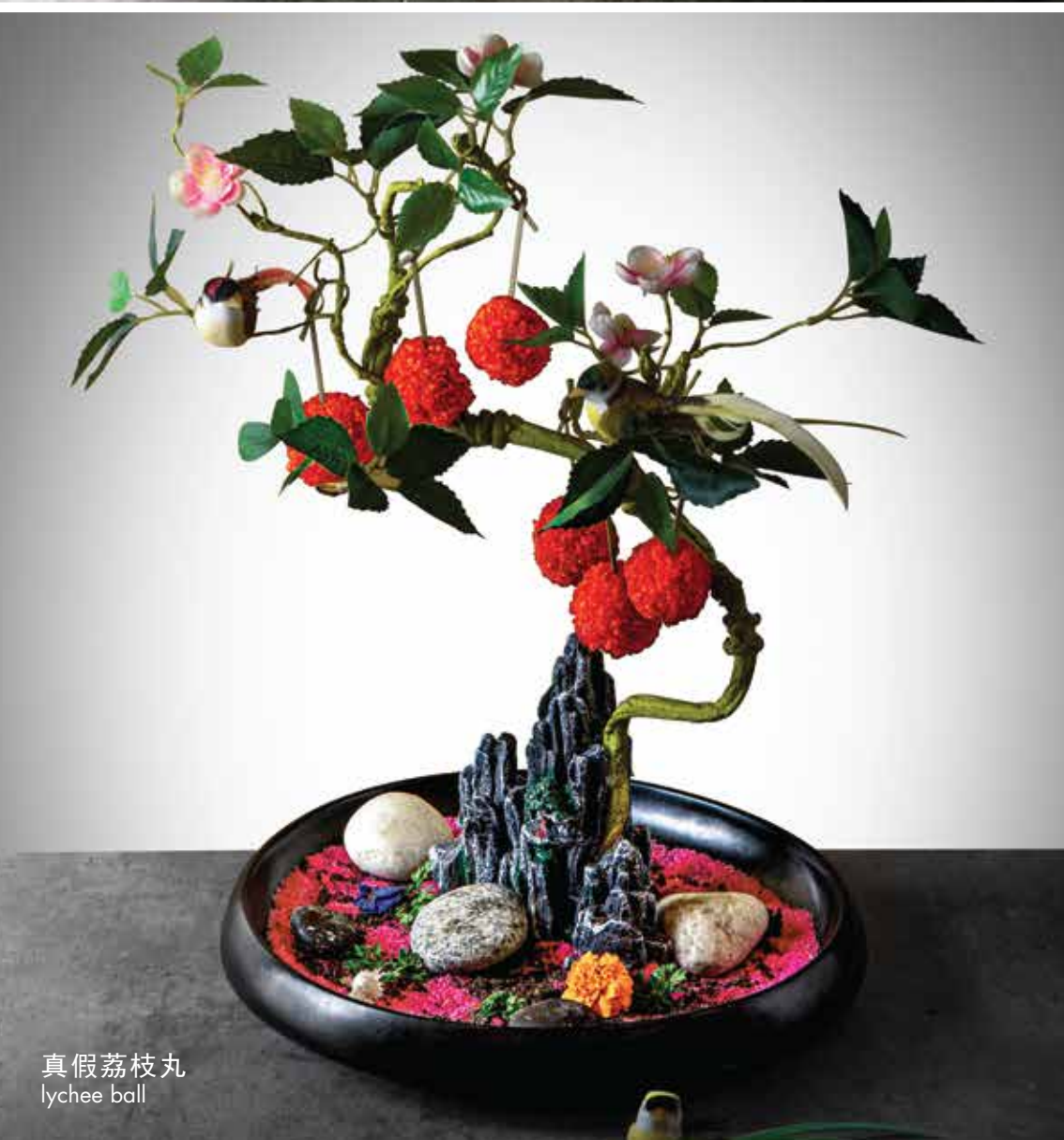
真假荔枝丸 lychee ball