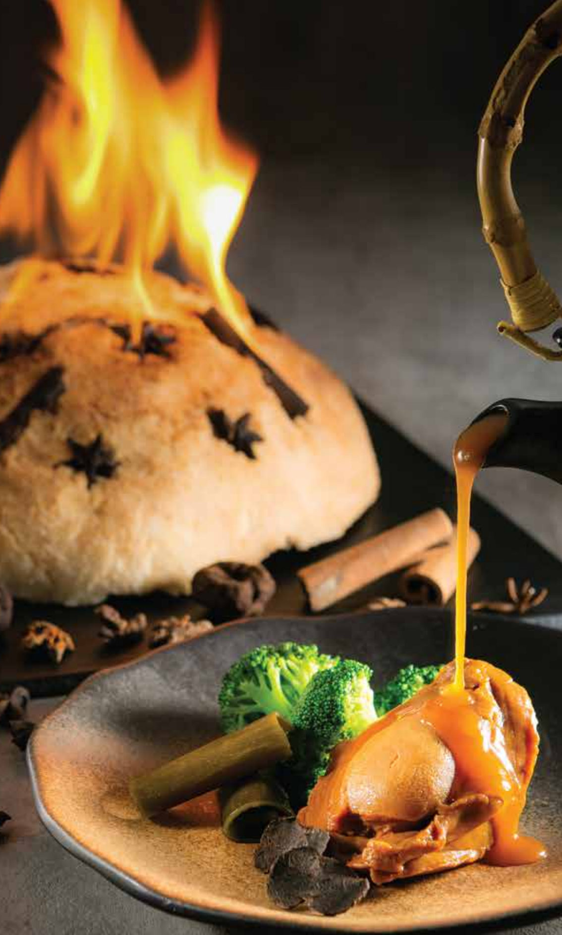
松露盐焗昆布鲍鱼 salt baked whole abalone with truffle & kombu