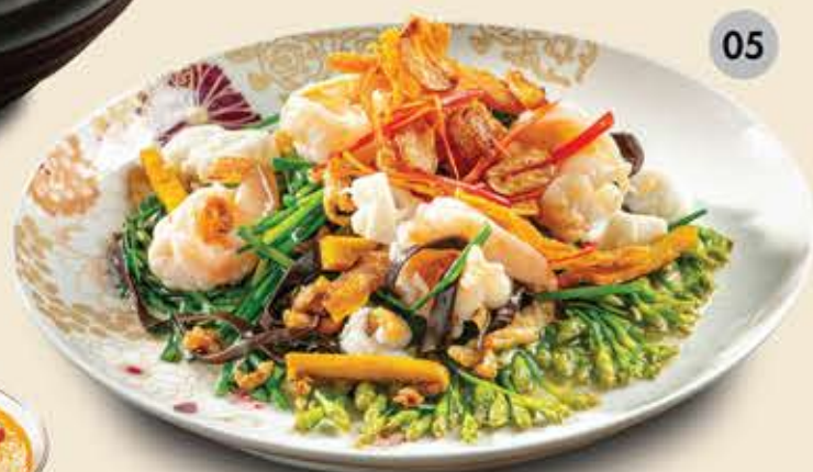
05 港城小炒皇 stir-fried farm fresh vegetables with seafood