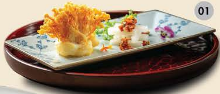
01 金针鲈鱼卷伴麻辣萝卜条 cod fish & enoki mushroom roll with mala radish