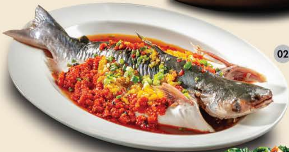
02 双椒蒸野果巴丁 steamed patin with sze chuan chilis