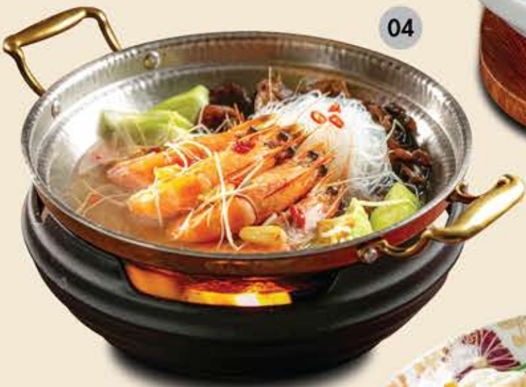
04 黄酒粉丝云胜明虾煲 claypot king prawn with chinese wine