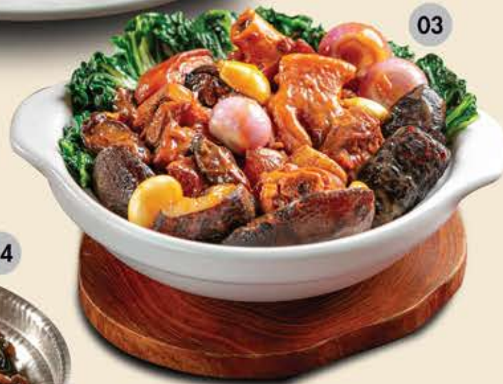
03 南乳蚝豉海参猪手煲 claypot pork trotter with sea cucumber & smoked oyster