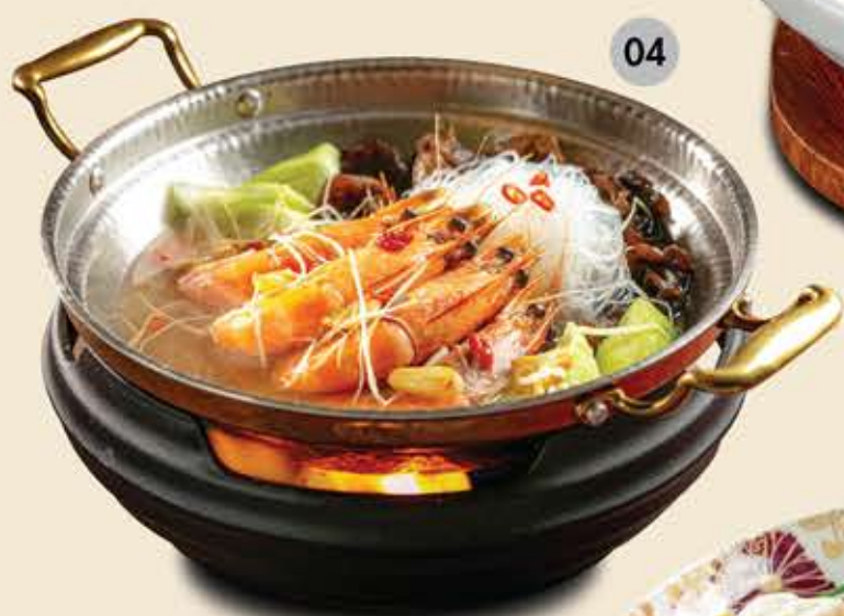
04 黄酒粉丝云胜明虾煲 claypot king prawn with chinese wine