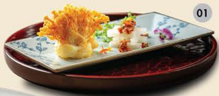
01 金针鲈鱼卷伴麻辣萝卜条 cod fish & enoki mushroom roll with mala radish