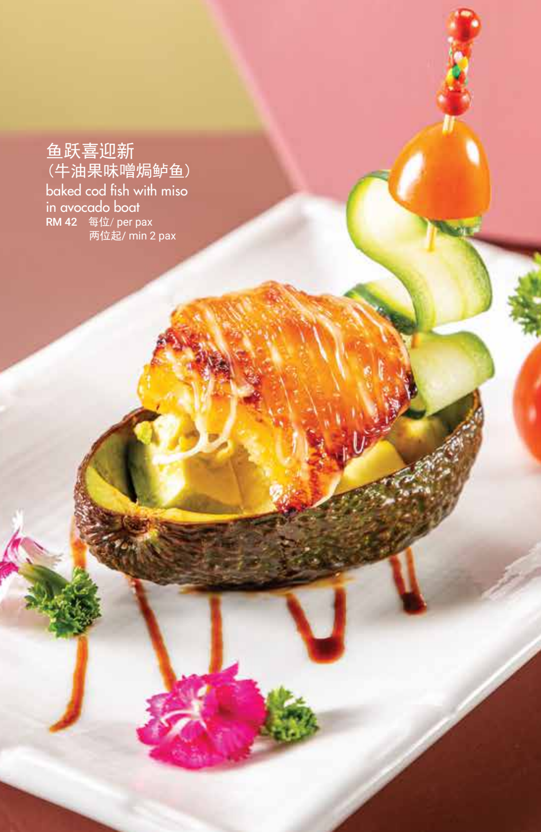
鱼跃喜迎新 (牛油果味噌焗鲈鱼) baked cod fish with miso in avocado boat RM 42 每位/ per pax 两位起/ min 2 pax