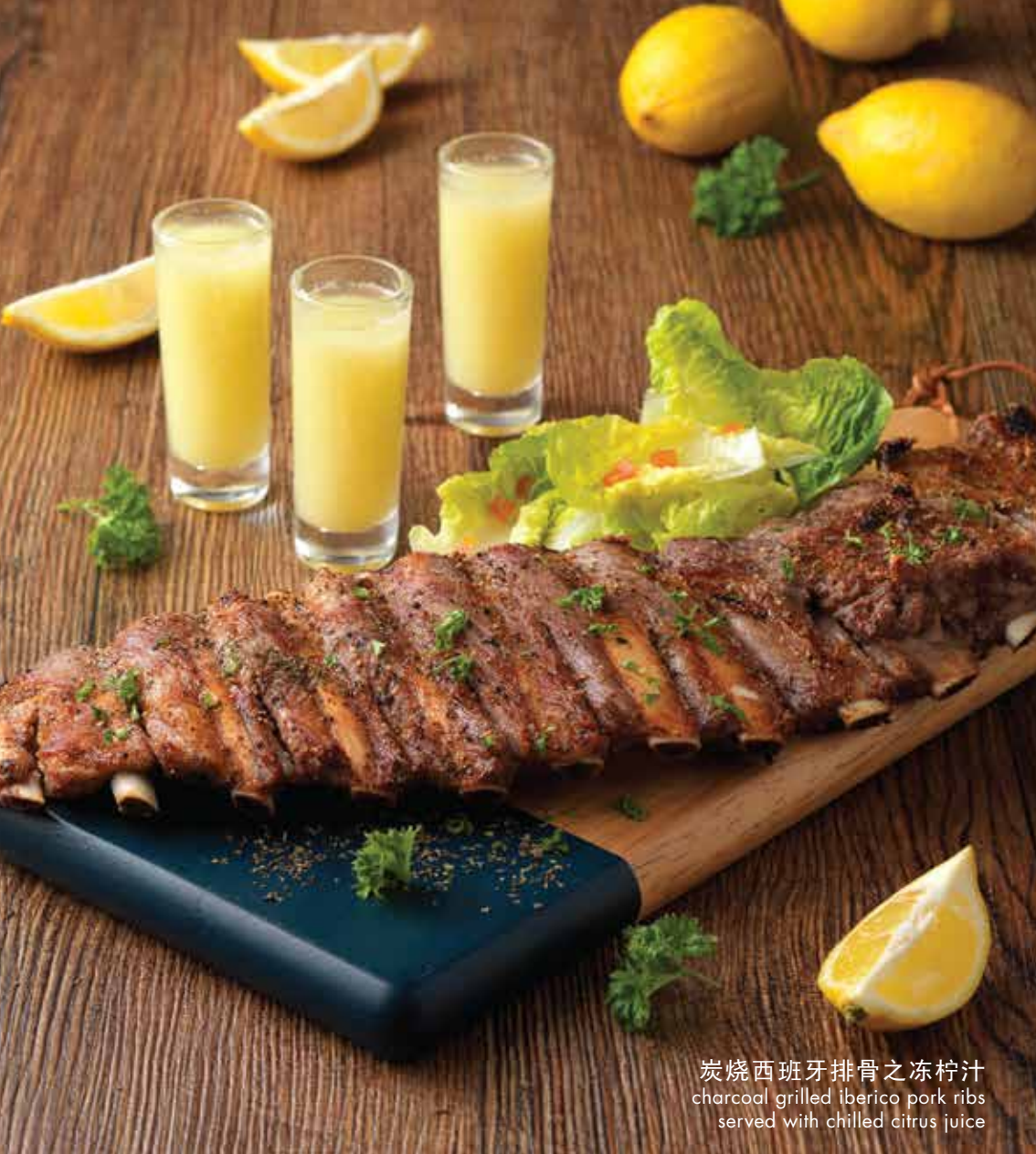
炭烧西班牙排骨之冻柠汁 charcoal grilled iberico pork ribs served with chilled citrus juice