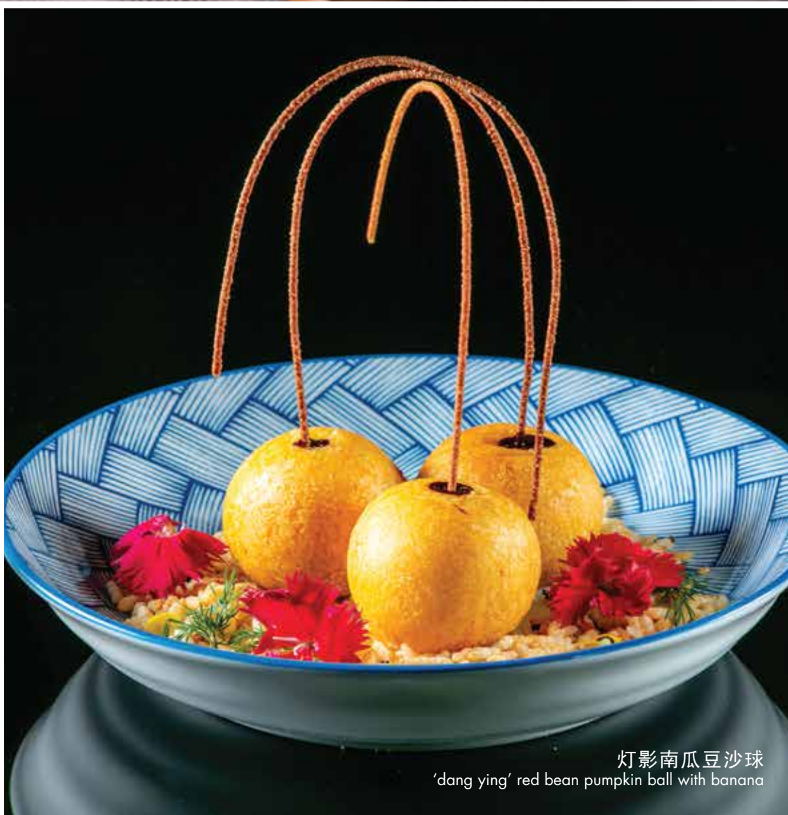
灯影南瓜豆沙球 'dang ying' red bean pumpkin ball with banana