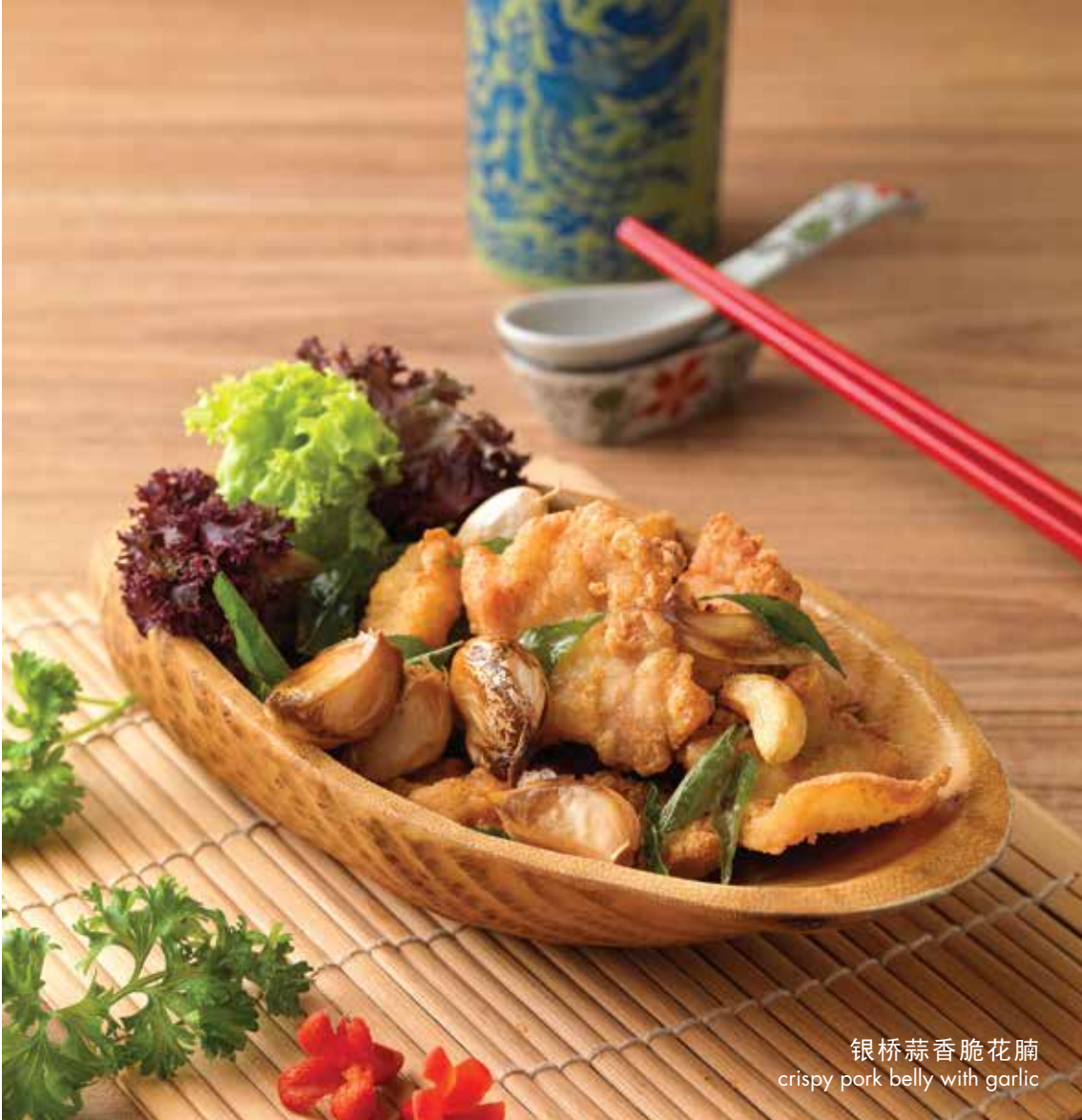
银桥蒜香脆花腩 crispy pork belly with garlic