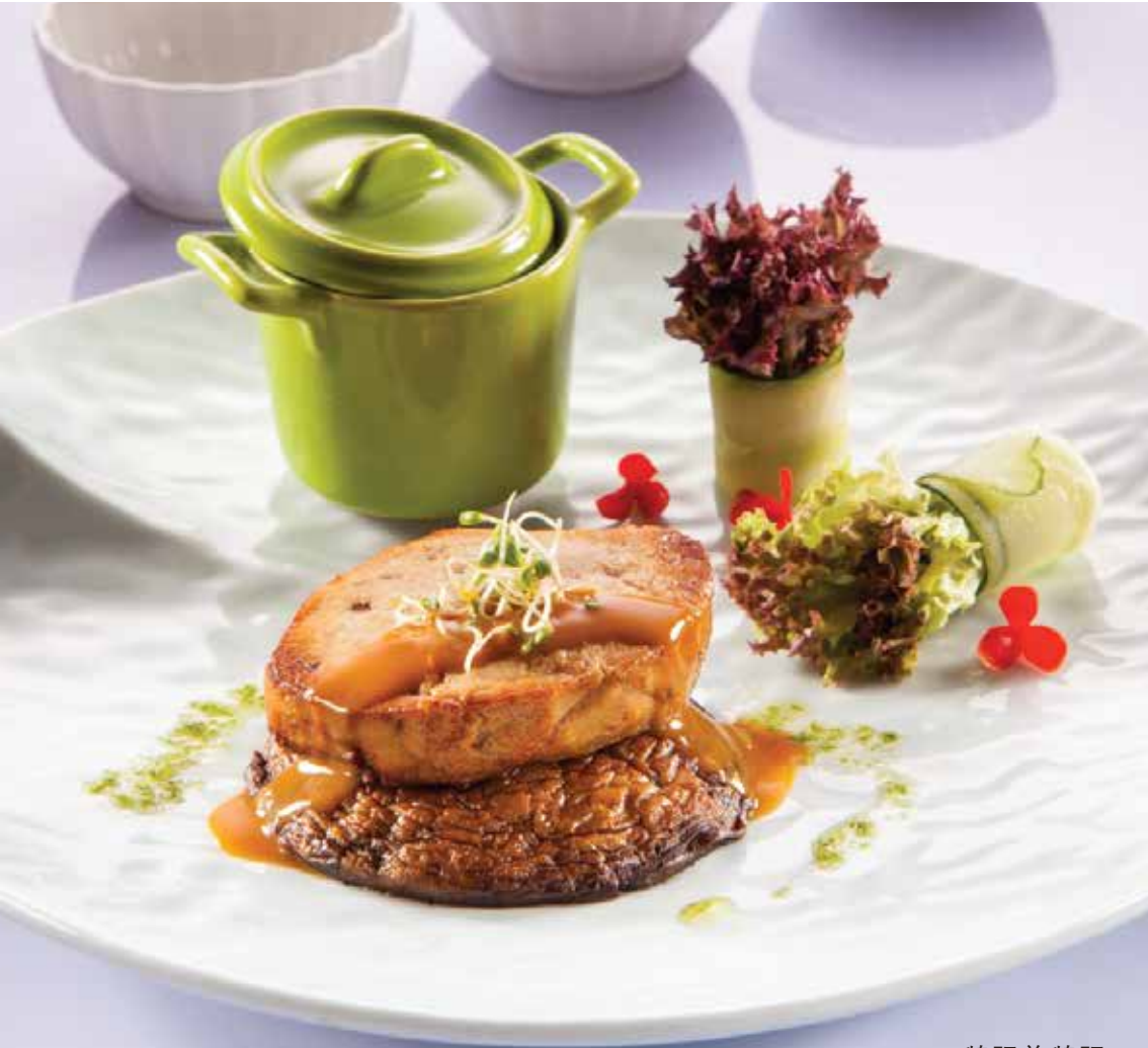
鹅肝煎鹅肝 pan-fried foie gras with portobello mushroom