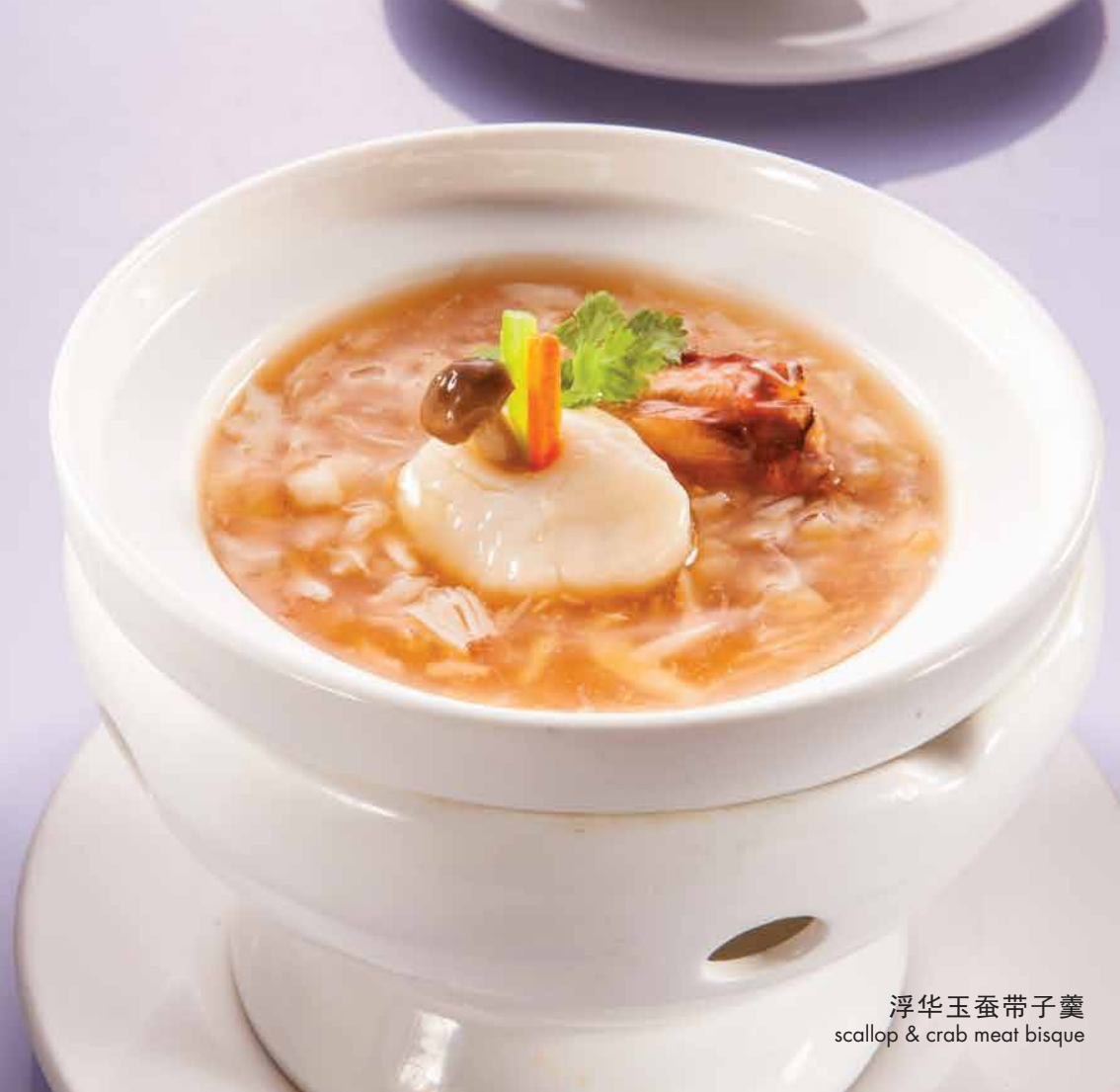
浮华玉蚕带子羹 scallop & crab meat bisque