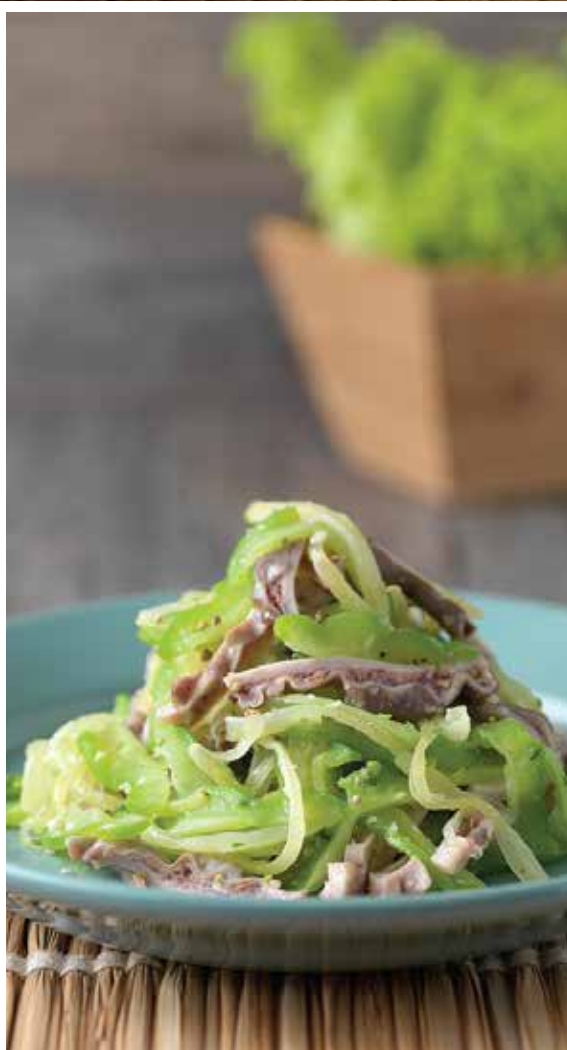
胡椒猪肚咸菜苦瓜 stir-fried bitter melon & salted vegetable with peppered pork stomach