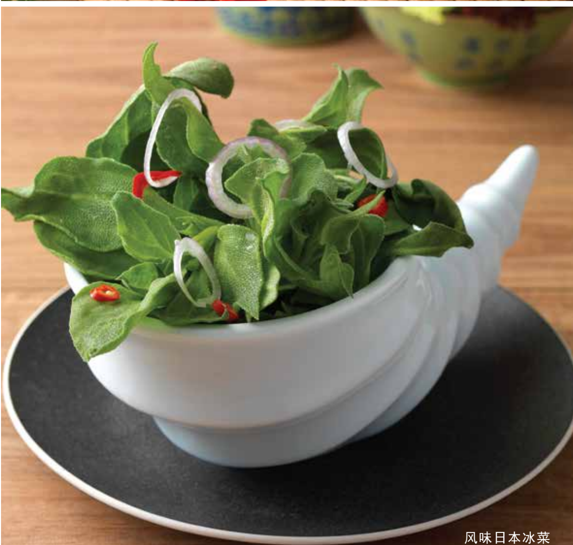
风味日本冰菜 japanese icy vegetable