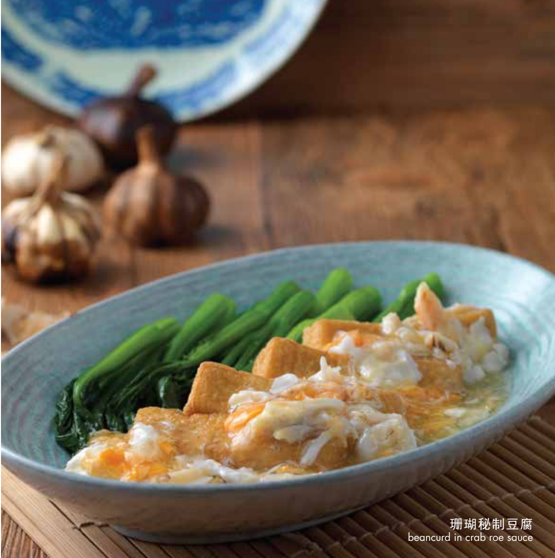
珊瑚秘制豆腐 beancurd in crab roe sauce