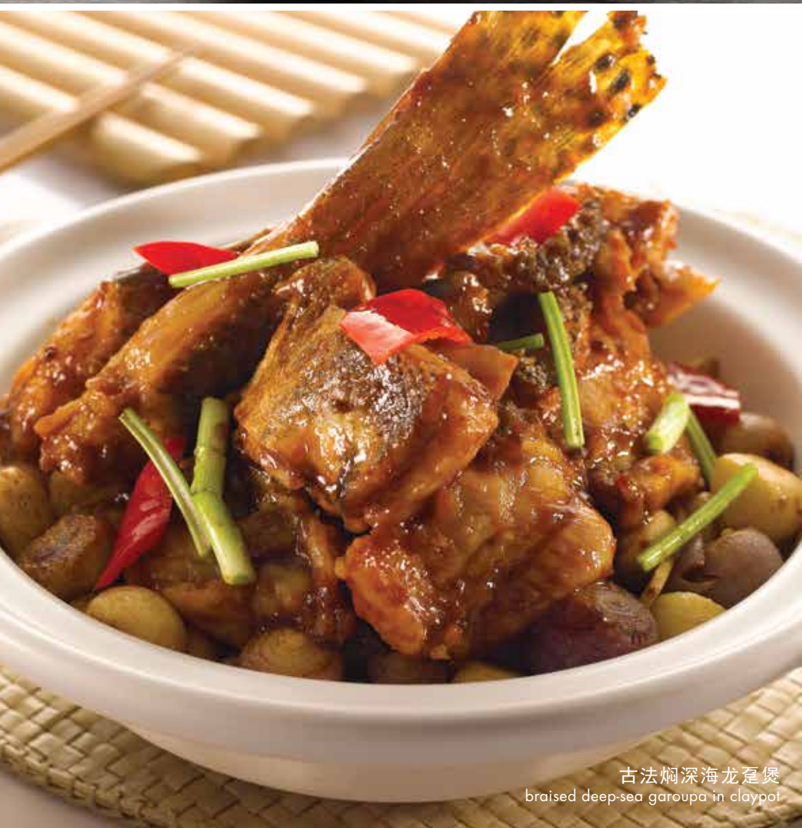
古法焖深海龙趸煲 braised deep-sea garoupa in claypot