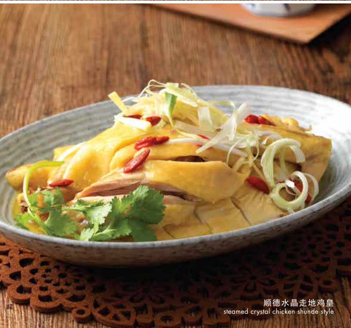
顺德水晶走地鸡皇 steamed crystal chicken shunde style