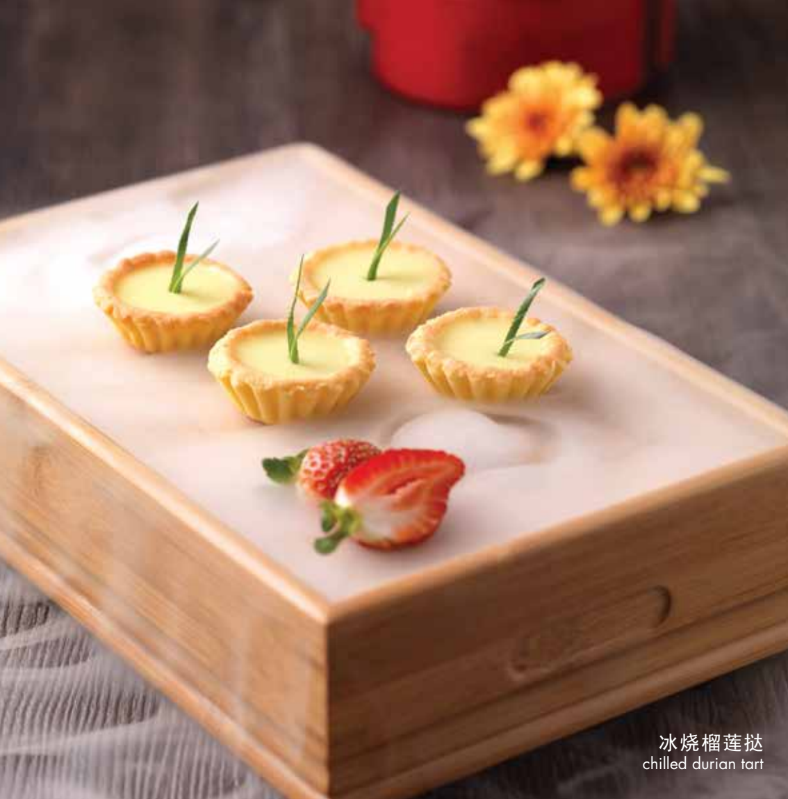
冰烧榴莲挞 chilled durian tart