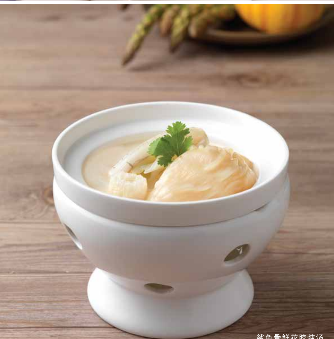
鲨鱼骨鲜花胶炖汤 double-boiled fresh fish maw in shark's bone soup