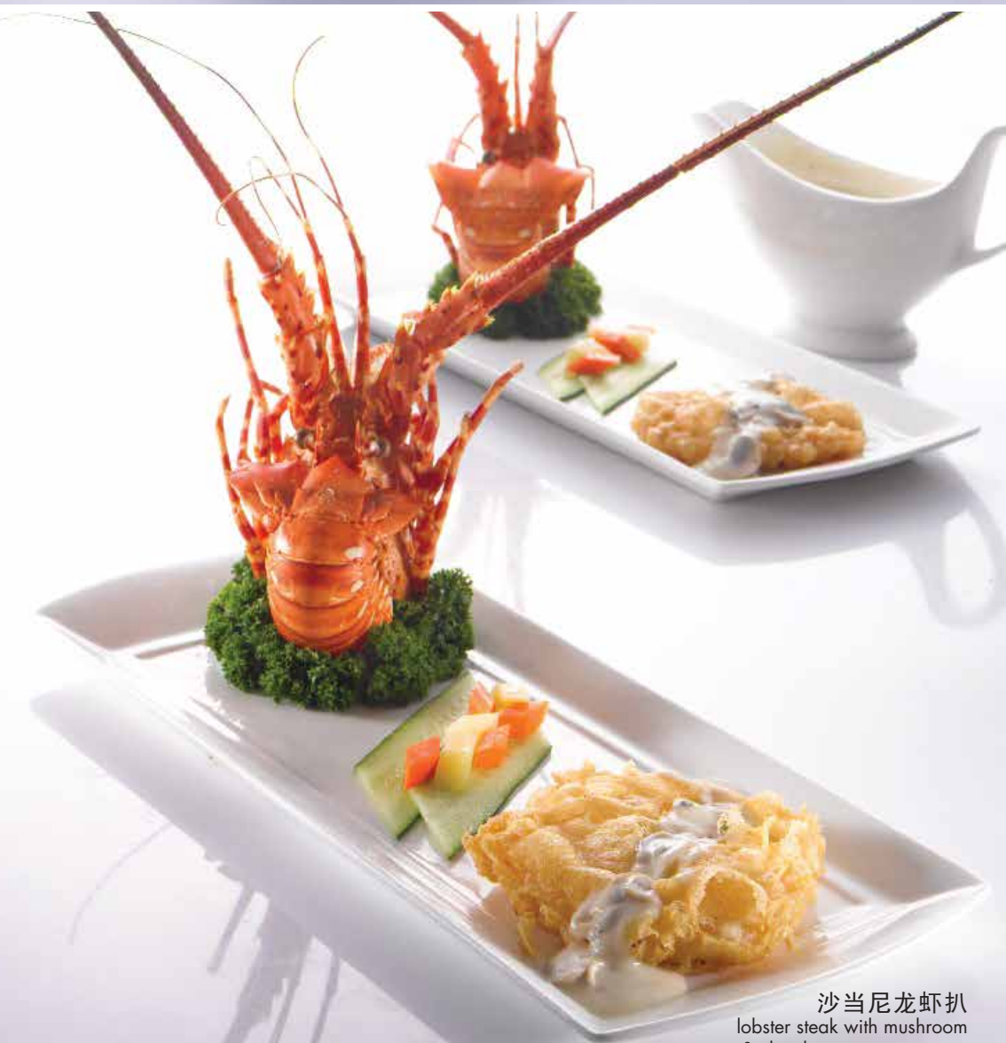
沙当尼龙虾扒 lobster steak with mushroom & chardonnay cream sauce