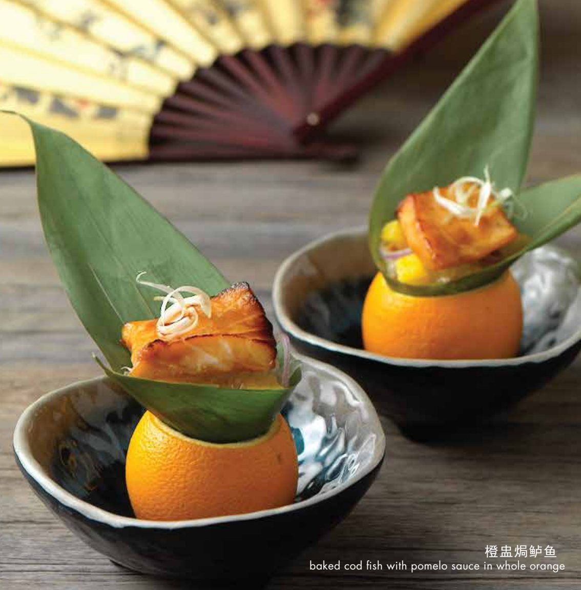
橙盅焗鲈鱼 baked cod fish with pomelo sauce in whole orange