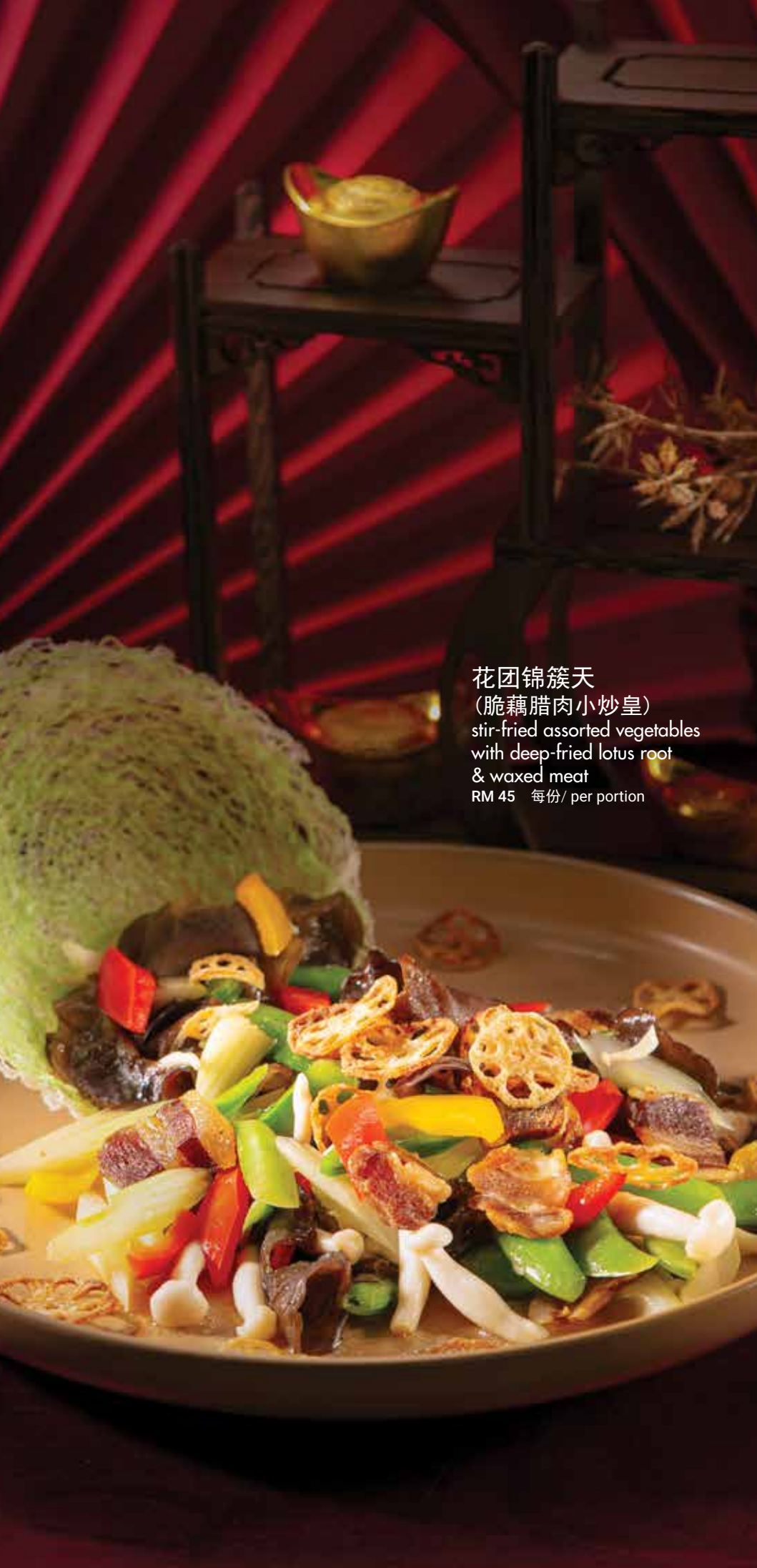
花团锦簇天 (脆藕腊肉小炒皇) stir-fried assorted vegetables with deep-fried lotus root & waxed meat RM 45 每份/ per portion