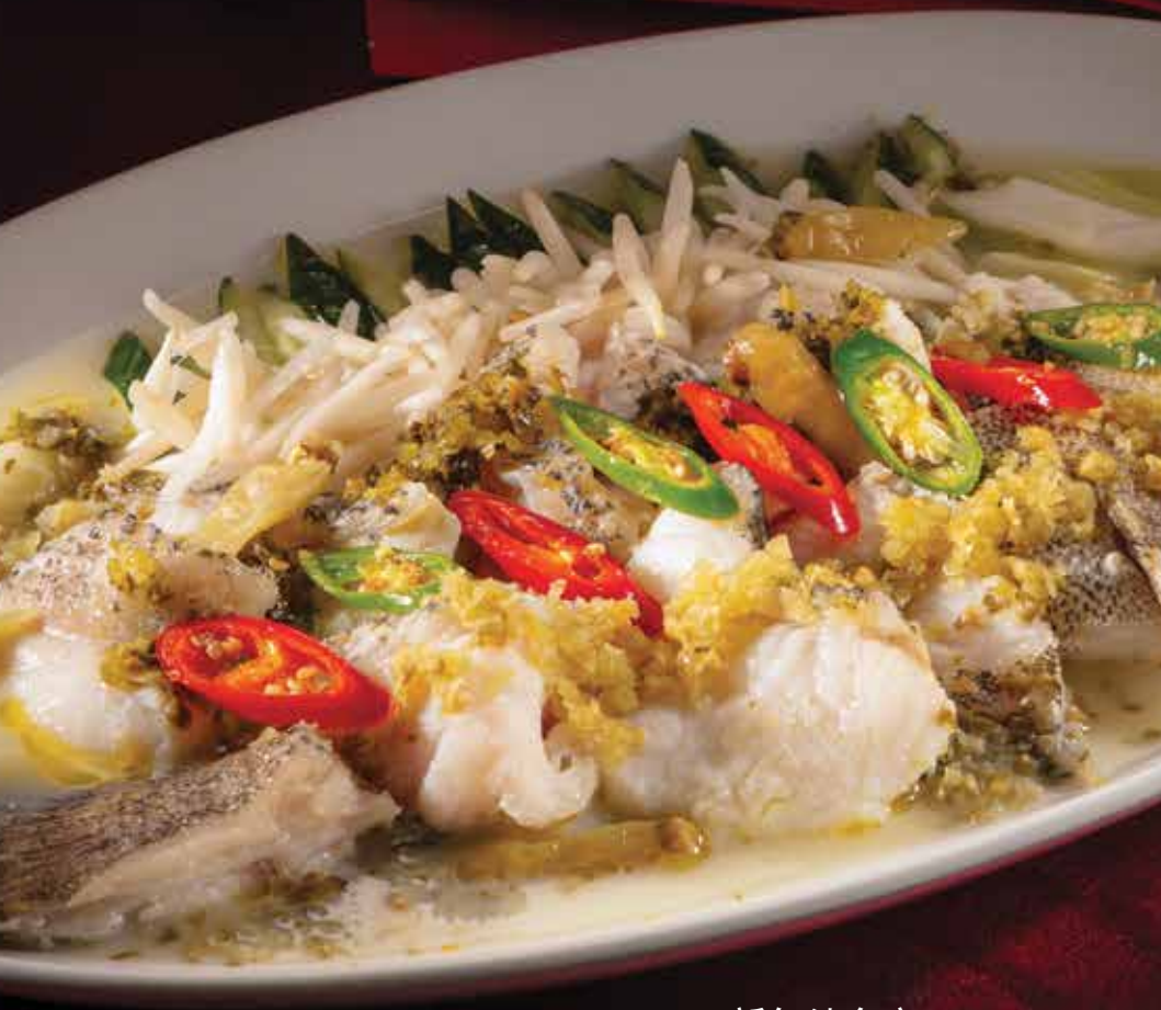
新年纳余庆 (四川水煮深海龙趸) poached deep-sea garoupa with pickled vegetables sze chuan style RM 168 每份/ per portion