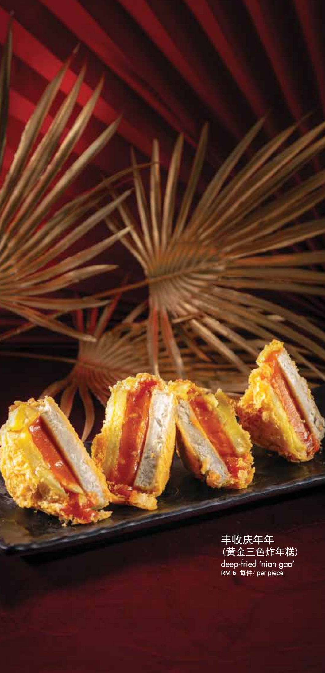
丰收庆年年 (黄金三色炸年糕) deep-fried 'nian gao' RM 6 每件/ per piece