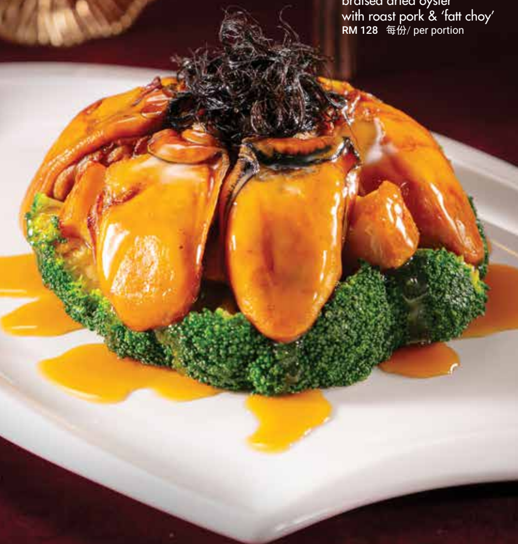
好事成双来 (发财火腩沙井蚝土) braised dried oyster with roast pork & 'fatt choy' RM 128 每份 / per portion