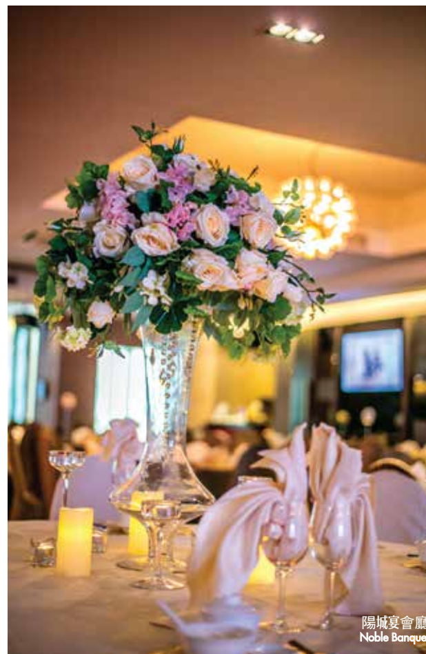
陽城宴會廳 Noble Banquet

星期五, 星期六, 星期日及公共假期 Fridays, Weekends & Public Holidays