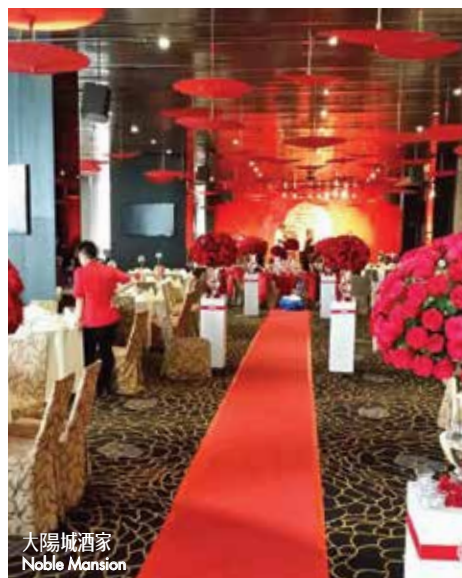
大陽城酒家 Noble Mansion