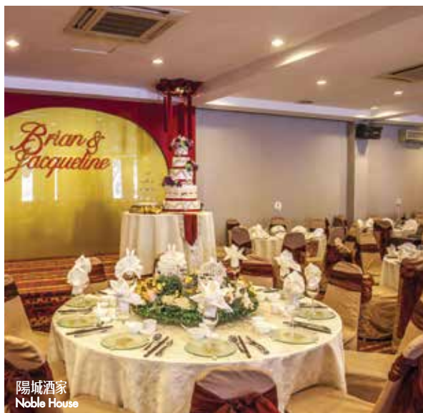
陽城酒家 Noble House