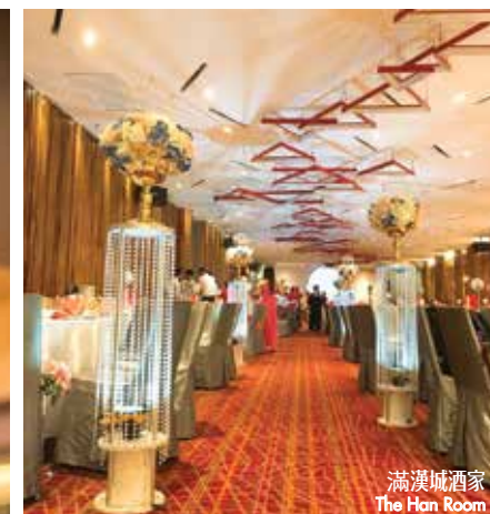
滿漢城酒家 The Han Room