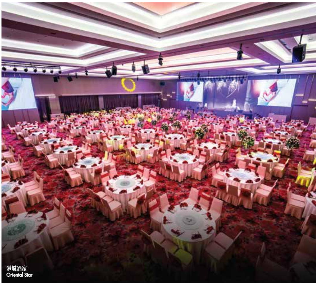
港城酒家 Oriental Star