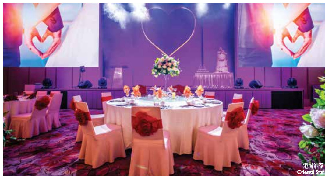
港城酒家 Oriental Star