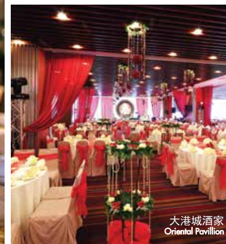
大港城酒家 Oriental Pavilion