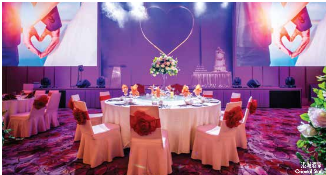
港城酒家 Oriental Star