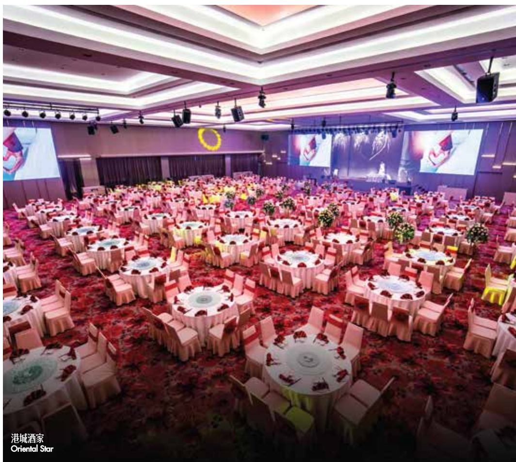
港城酒家 Oriental Star