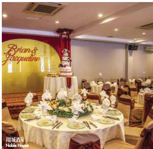
陽城酒家 Noble House