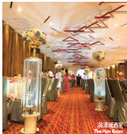
滿漢城酒家 The Han Room