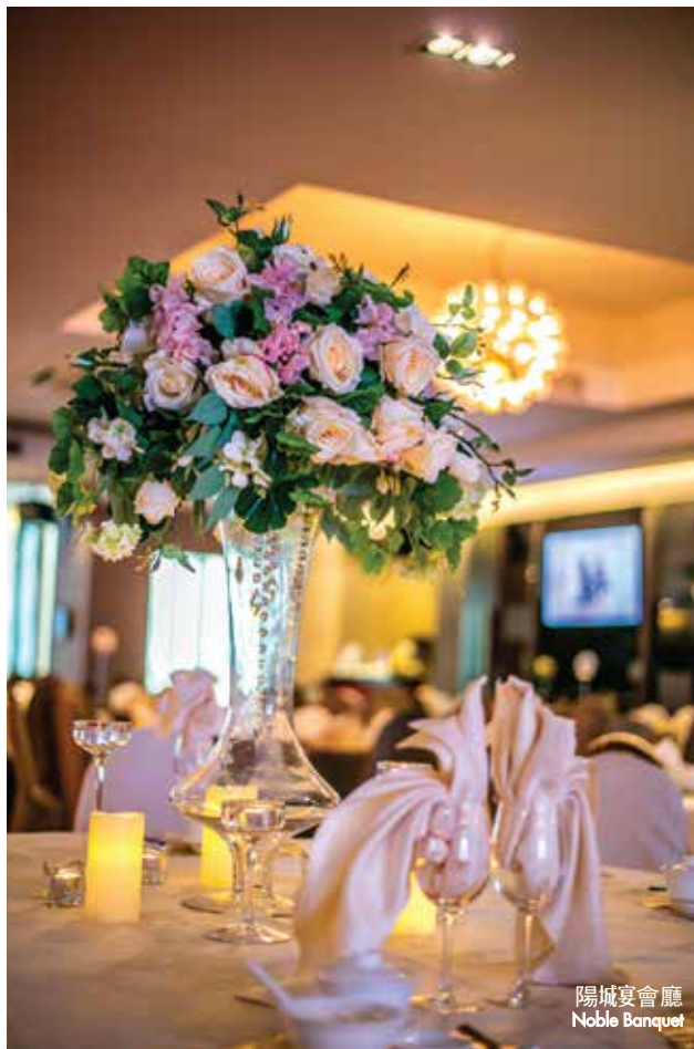
陽城宴會廳 Noble Banquet