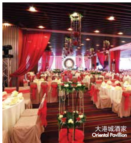
大港城酒家 Oriental Pavillion