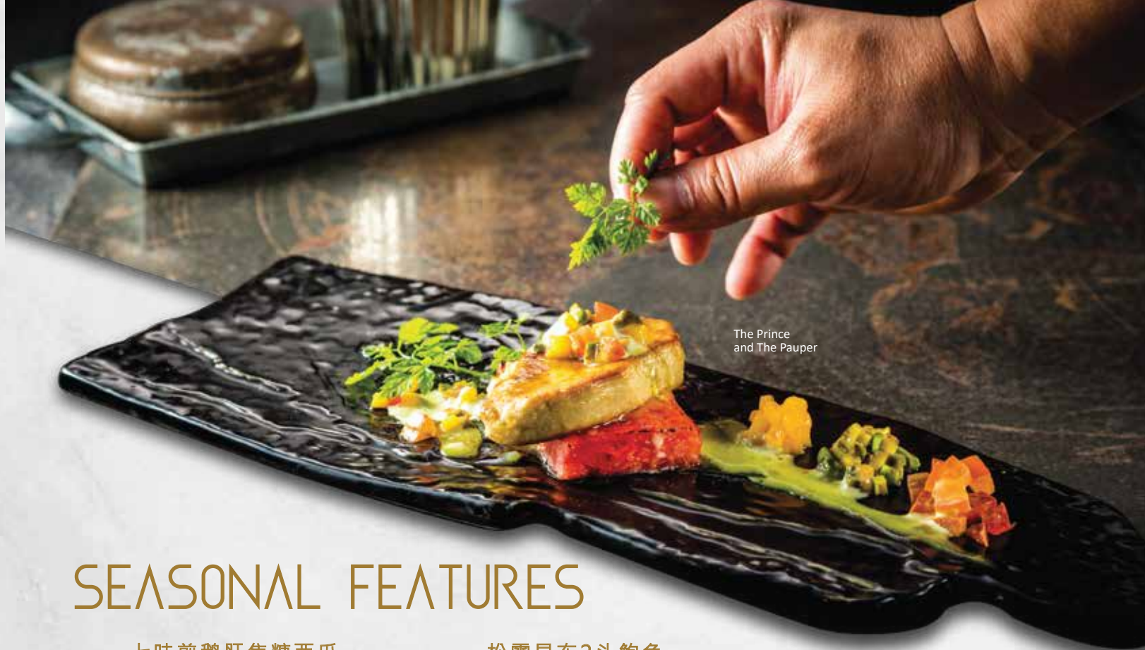
The Prince and The Pauper