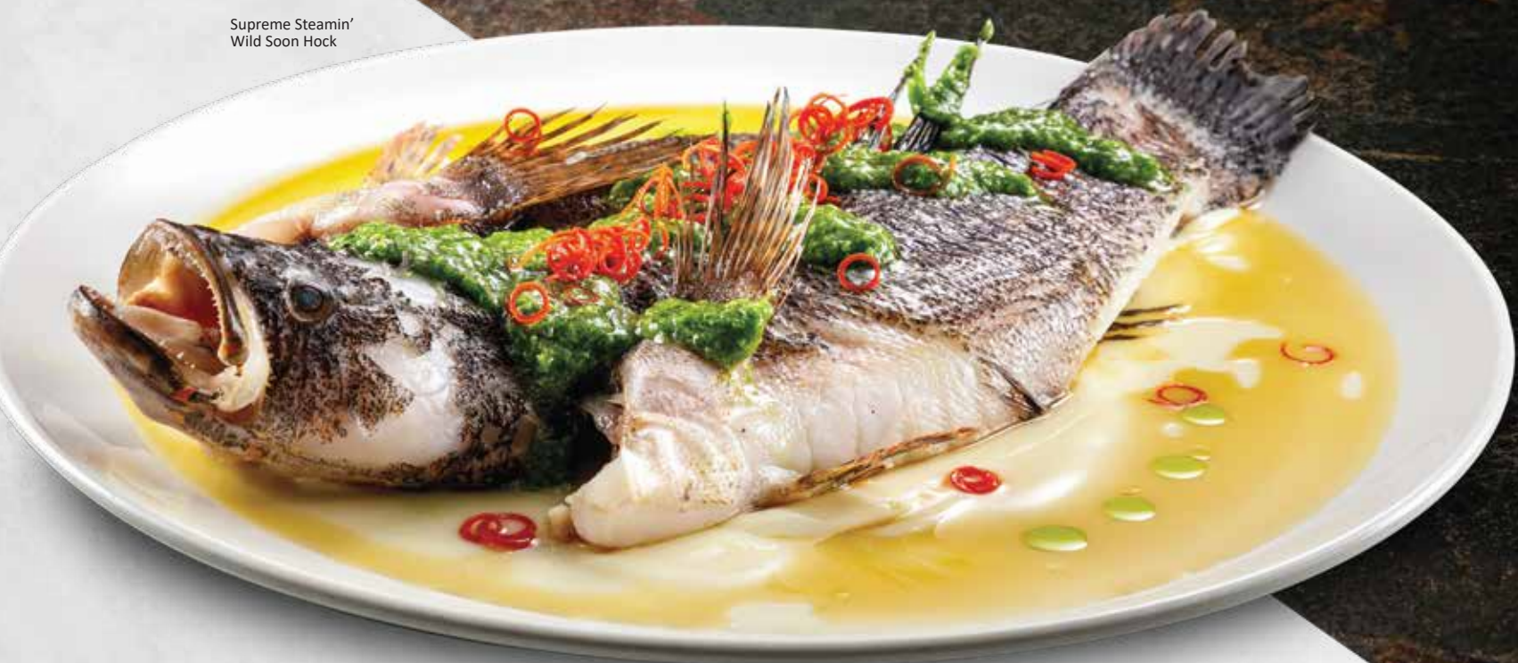
Supreme Steamin' Wild Soon Hock