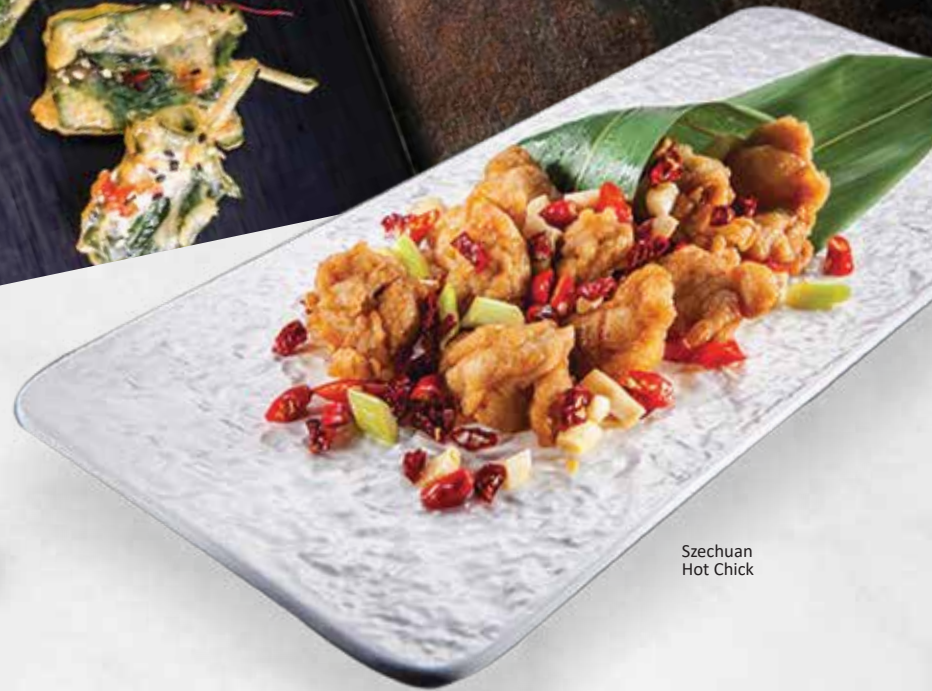
Szechuan Hot Chick