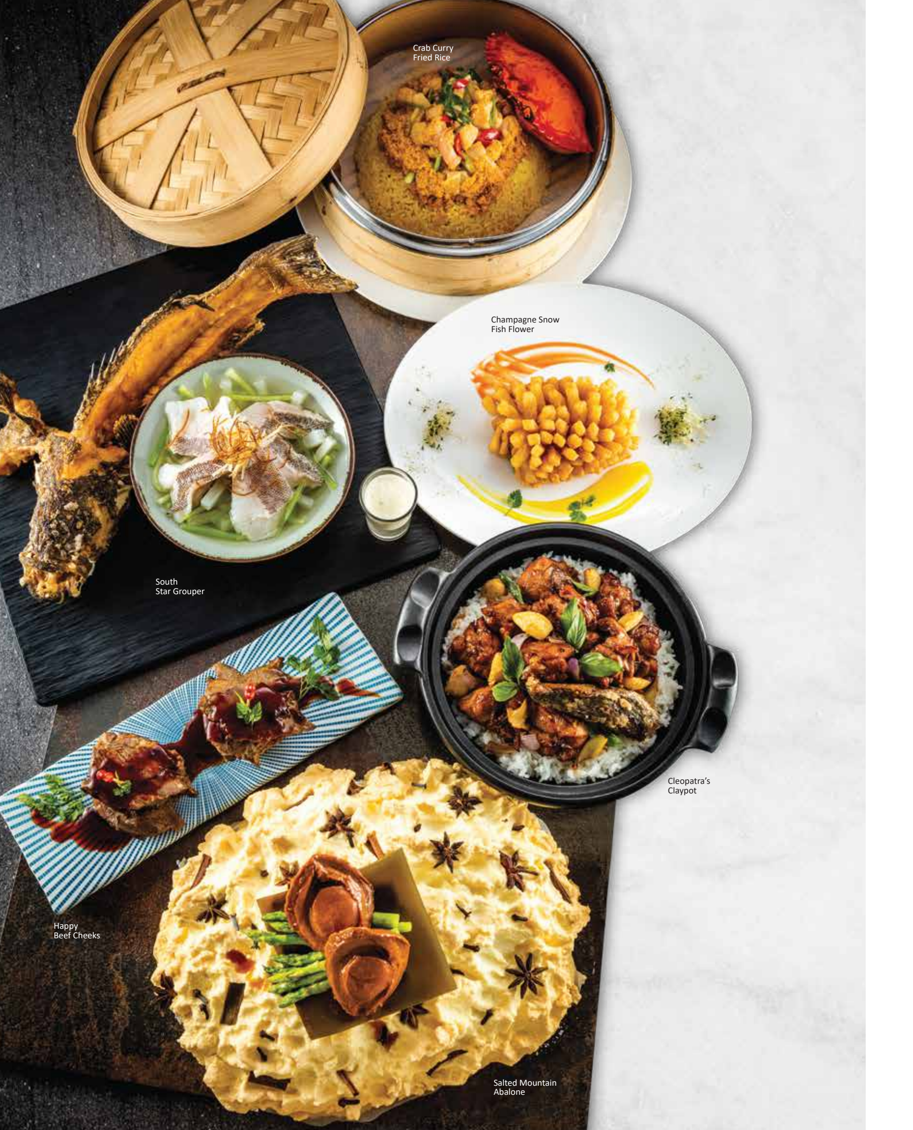
Crab Curry Fried Rice