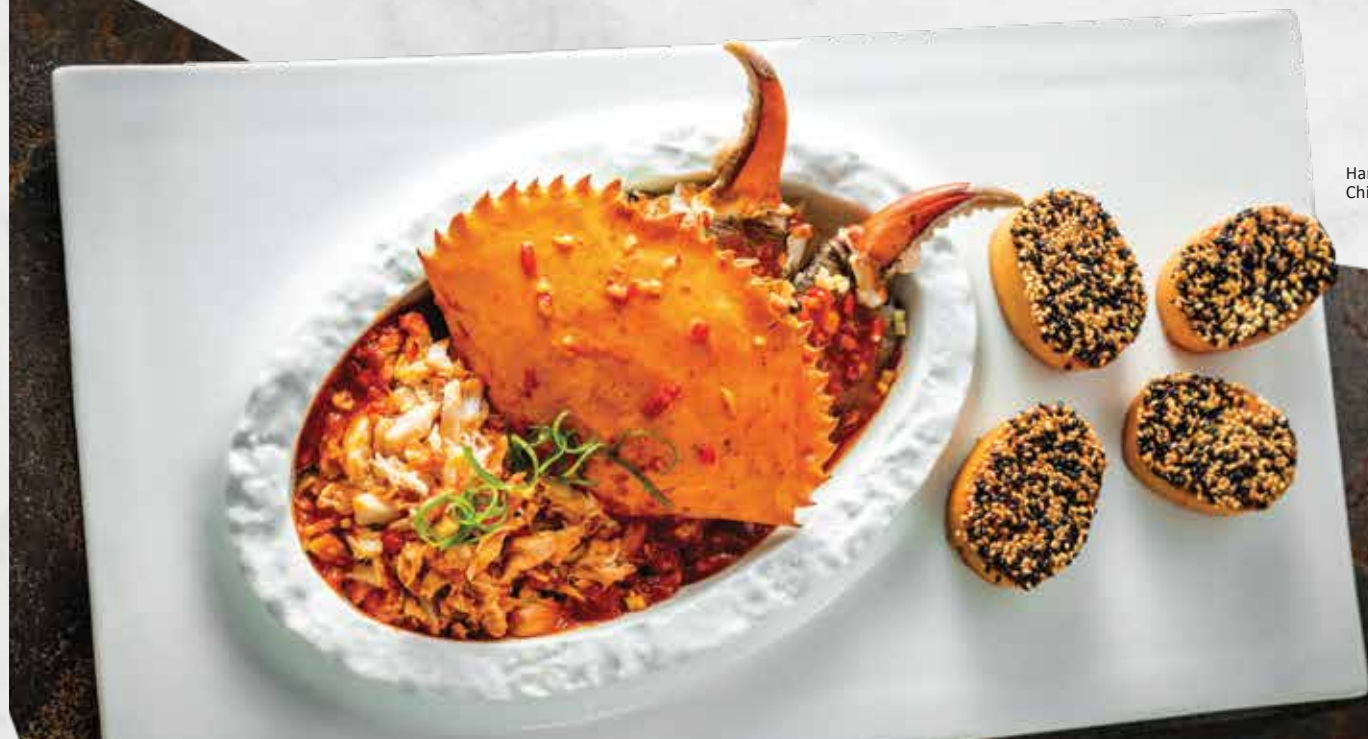
Hands-free Chilli Crab