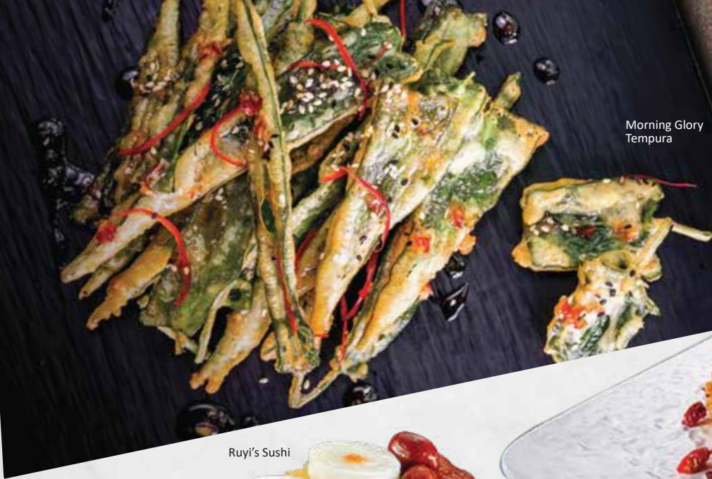
Morning Glory Tempura